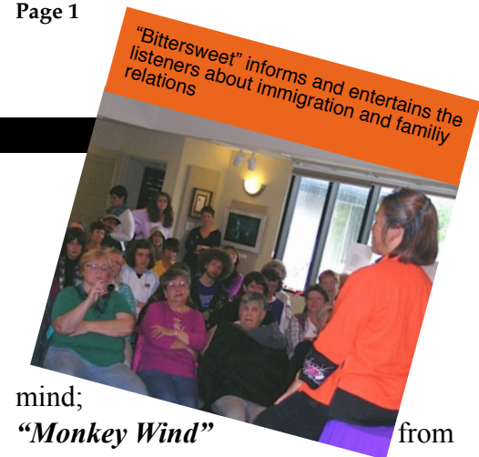
"Bittersweet" informs and entertains the listeners about immigration and family relations