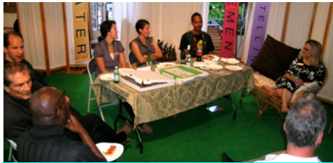
"Hugsfest" at ENT Studio engages with artists from Young Audiences of No. California- one of our Salon partnerships.

tions with other arts groups and organizations. Some of the exciting partnerships will be with the following arts organizations: Young Audiences of Northern California, Philippine American Writers Association, Asian American Women Artist Association, Storytellers Association of California. Each of these organizations come with their community connections to dozens of Bay Area artists. By collaborating, ENT hopes to broaden our outreach, advocate for more arts and storytelling in the community. So be on the lookout for our next series: www.ethnohtec.org/salon