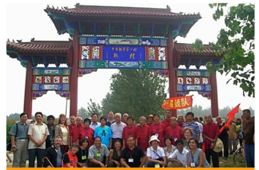
New gateway welcomes Americans to the storytelling community.

Much has changed in the village. We see larger homes being built, old homes being torn down, and also a seeming emptier village. Four elder tellers passed away since our last visit in 2007, taking with them 100s of their stories. Children are few with their 20-30+ year old parents working in big cities. The school has only two of the seven classrooms opened. This is one of the effects of globalization and our economic times. We are very concerned about their storytelling tradition. To whom will they pass down their stories?